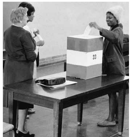
A young woman casting her ballot in the 1964 presidential election.