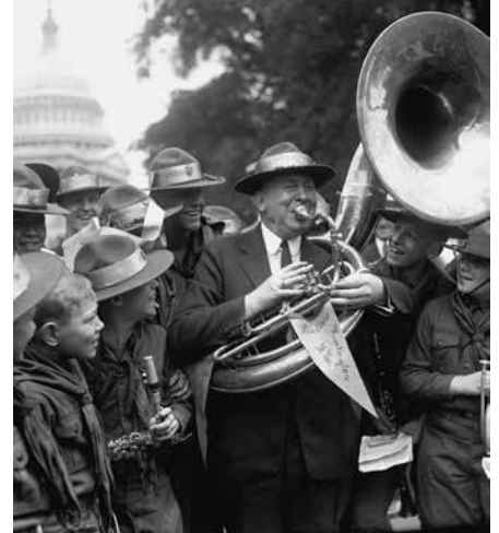
Congressman George W. Johnson of West Virginia with a Boy Scout band from his state, June 4, 1924.

Voting for your representative is an important right and responsibility.