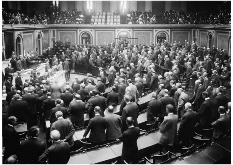
Opening of the last session of the 62nd Congress on December 2, 1912.

Copy the Civics Test question and answer.