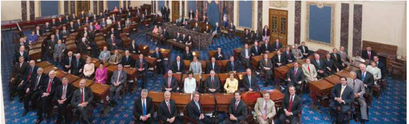
The Senators of the 109th Congress.