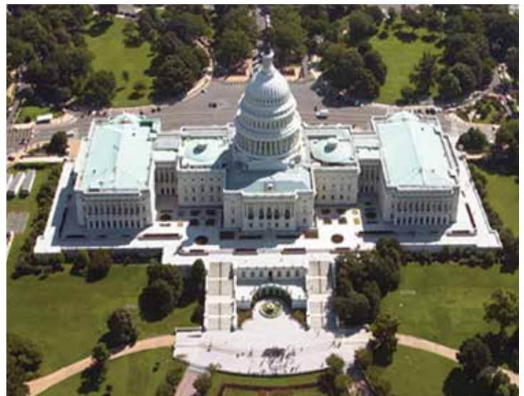
Aerial view of the west front of the U.S. Capitol in Washington, D.C.

Courtesy of the Architect of the Capitol.